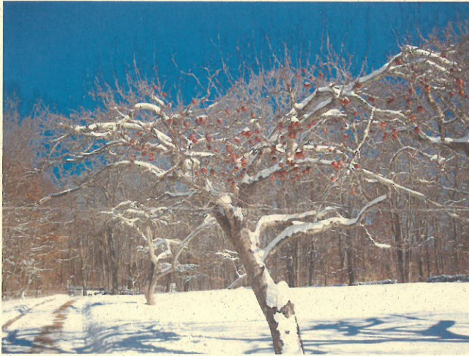
Apple Trees, Pendleton Hill Road

All around North Stonington there are places both large and small for us to enjoy and take care of