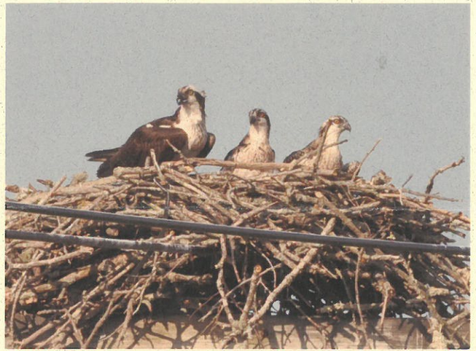
Osprey Family, Industrial Drive