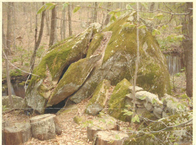
Boulders, Lake of Isles Preserve